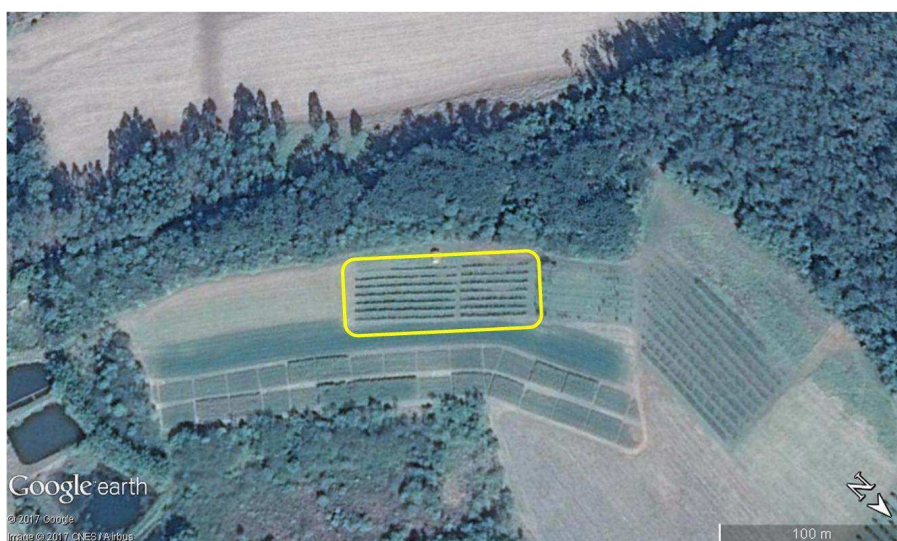
Fig. 1. Map showing the Germplasm Bank of stone fruits. Capão Bonito, SP, Brazil

hot summer, according to the Köppen classification). Annually, the municipality of Capão Bonito has approximately 100 hours of cold (temperature below 7.2°C) and an average rainfall of 1,236 mm [2].